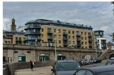
Kew Bridge, Brentford