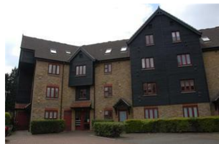
The Ham, Brentford