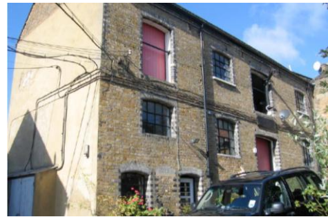
Bradbury's Yard, Brentford